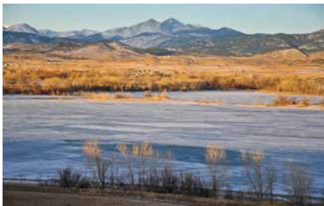
Heron Lakes