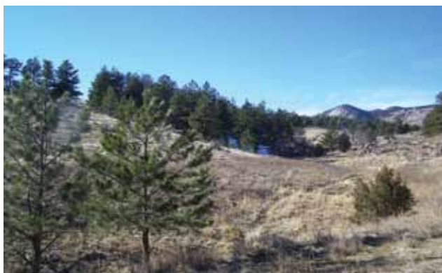
Sylvan Dale Ranch Conservation Easement