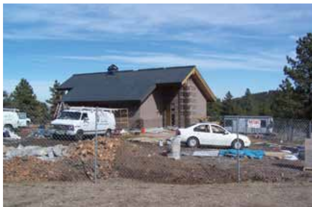
Carter Lake construction