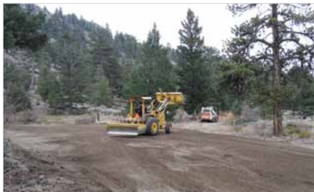
Hermit Park construction

This project will add 13 new campsites, improve 29 others, complete major road and drainage repairs, and add four vault toilets. Scheduled completion is Spring, 2012. Financials to be reported in 2012.